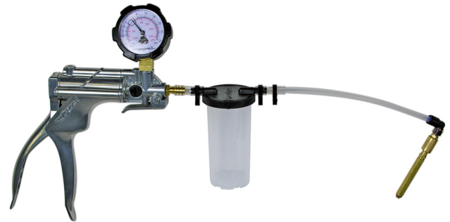
Figure 1: E-DWT-H Fill Kit, Assembled