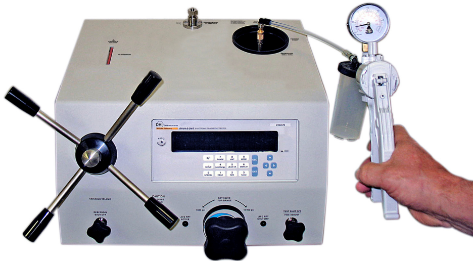
Figure 3: Evacuating the E-DWT-H with fill kit

Fluke. Keeping your world up and running.®